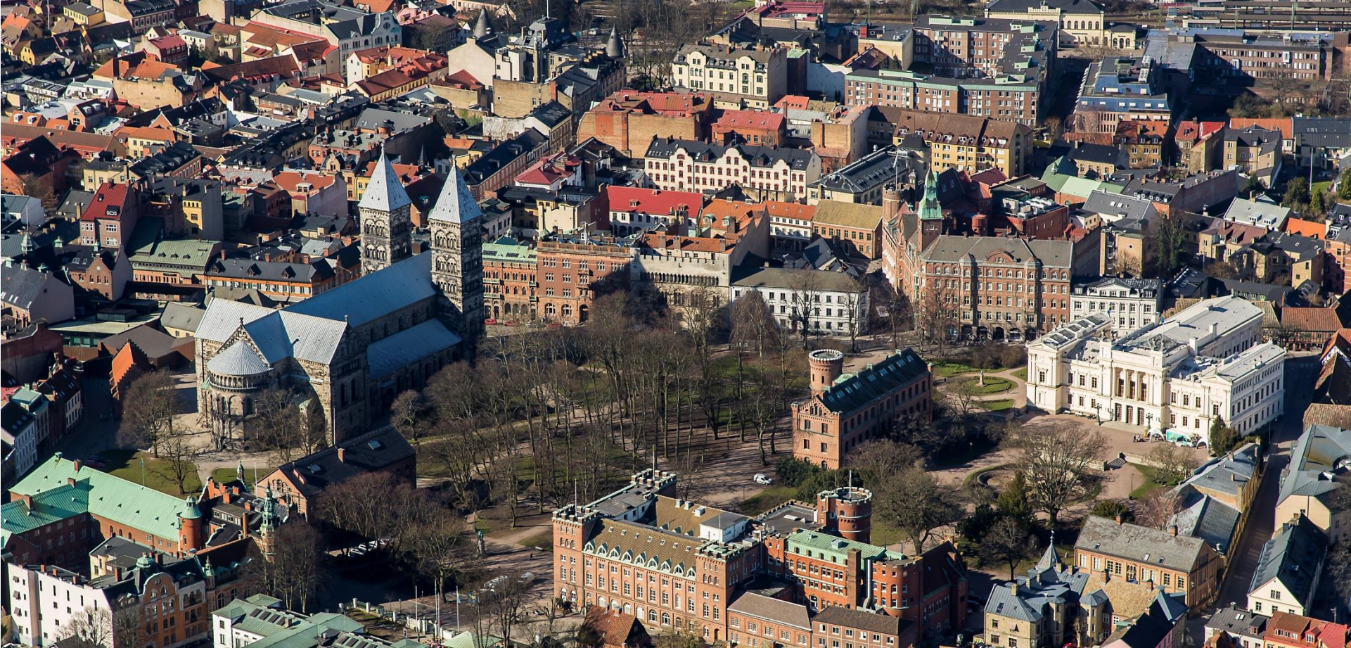
Cathedral of Lund, Sweden