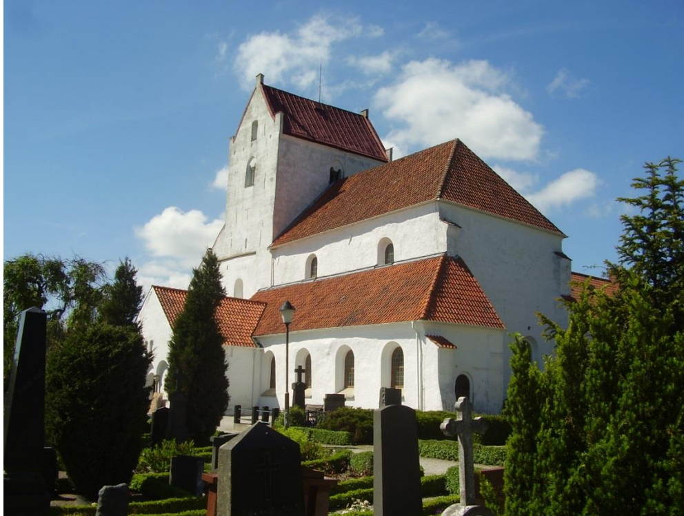
Dalby, 11 th Century