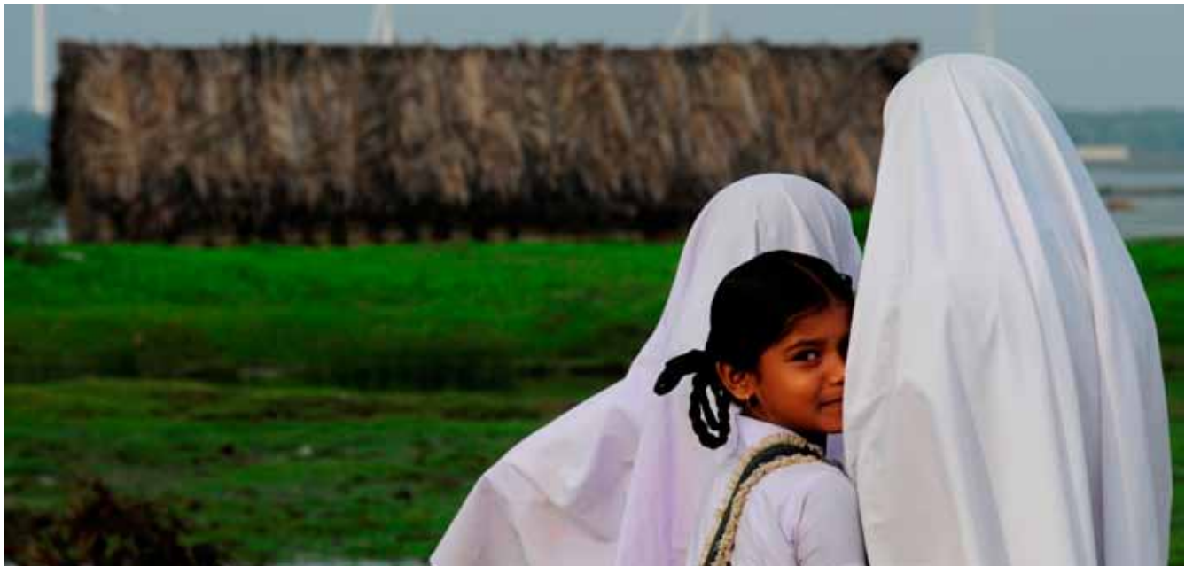
Muslims in Western Sri Lanka (Puttalam)

educators and women religious leaders working from within their respective religious traditions would add value to the knowledge. Particularly given the combined ability and competence to contribute to a deeper understanding of how a global normative system interacts with religious values – both positively and negatively.