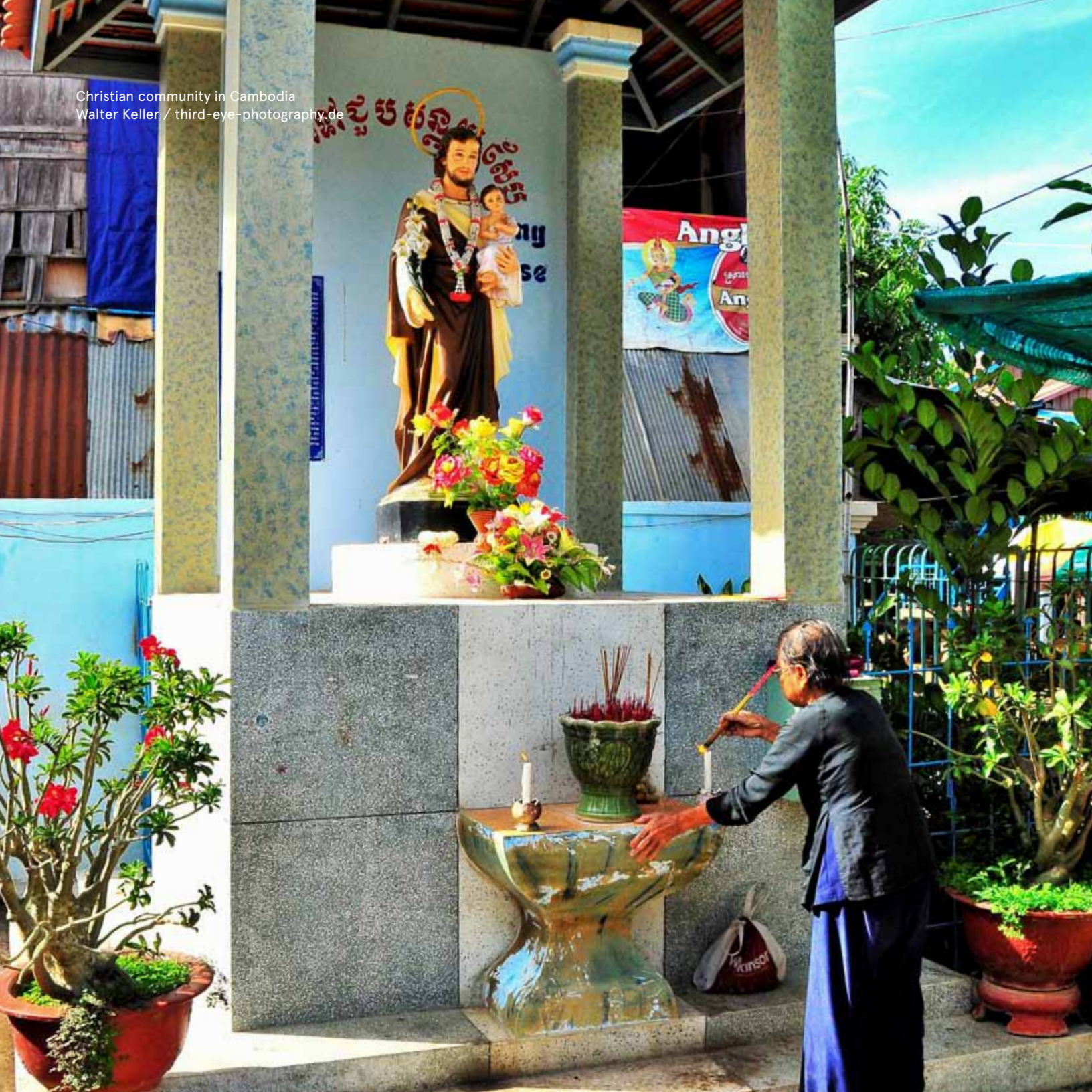
Christian community in Cambodia