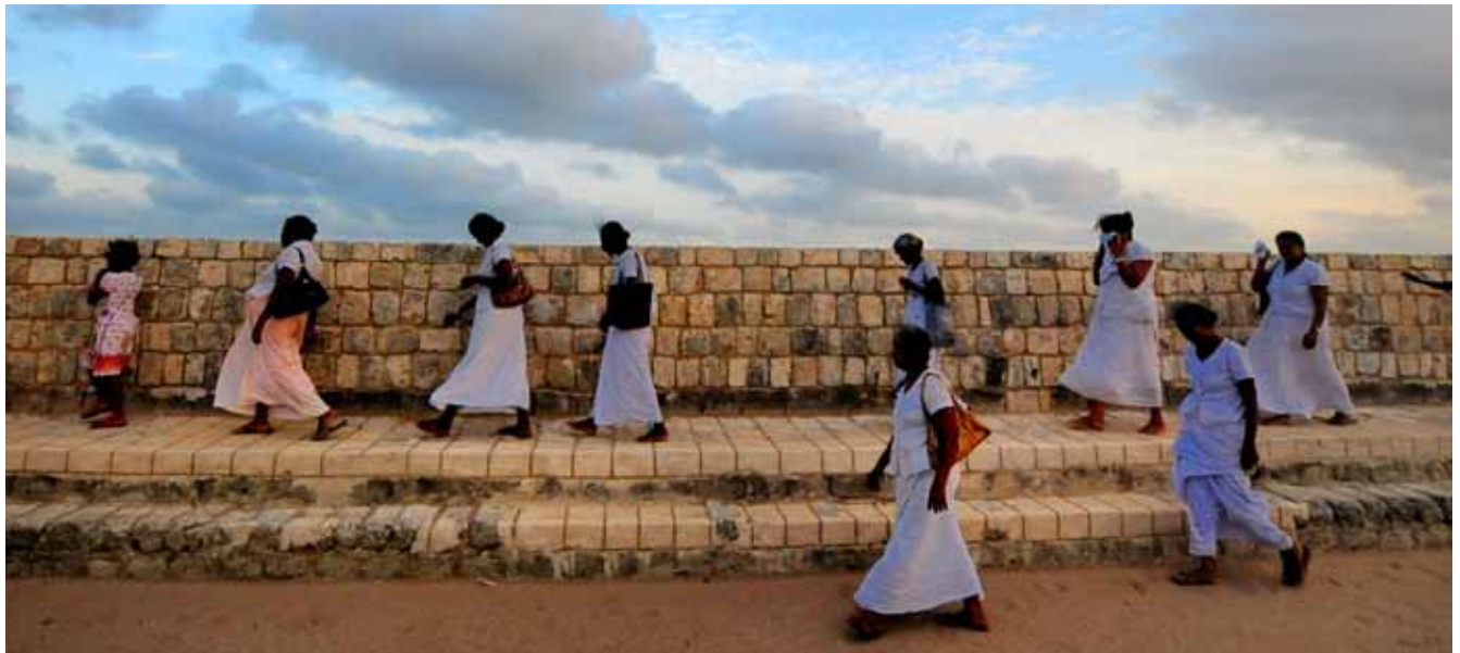
Buddhist women on their way to the temple

some skepticism, particularly on behalf of some in the secular international development world, as to whether local and national leadership of faith based institutions and communities can indeed join forces to realise rights' based justice work, particularly where it concerns more sensitive issues such as SRHR.