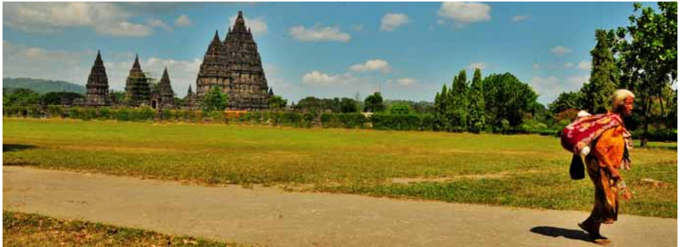
Pilgrim leaving the ancient Hindu Tempel at Prambanan, Central Java, Indonesia

views. After all, those within faith-based or faith-inspired organizations with a “hands-on” experience of service delivery and actual community-rooted activism, offer unique perspectives based on their contextual understandings of how they relate their faith to their daily work for justice and health. And yet the question remains: how can women of faith have a voice and a key role in the realization of Agenda 2030?