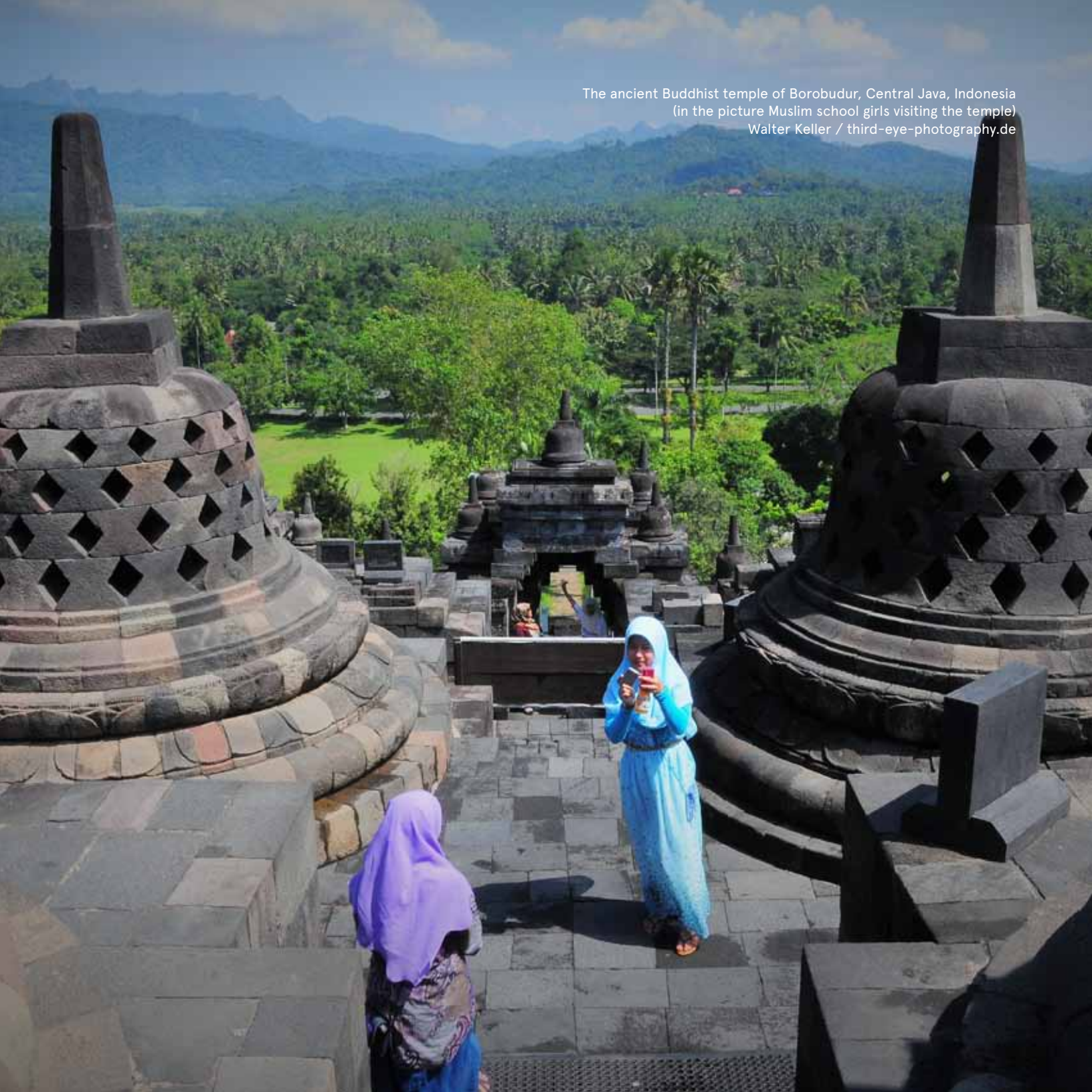
The ancient Buddhist temple of Borobudur, Central Java, Indonesia (in the picture Muslim school girls visiting the temple)