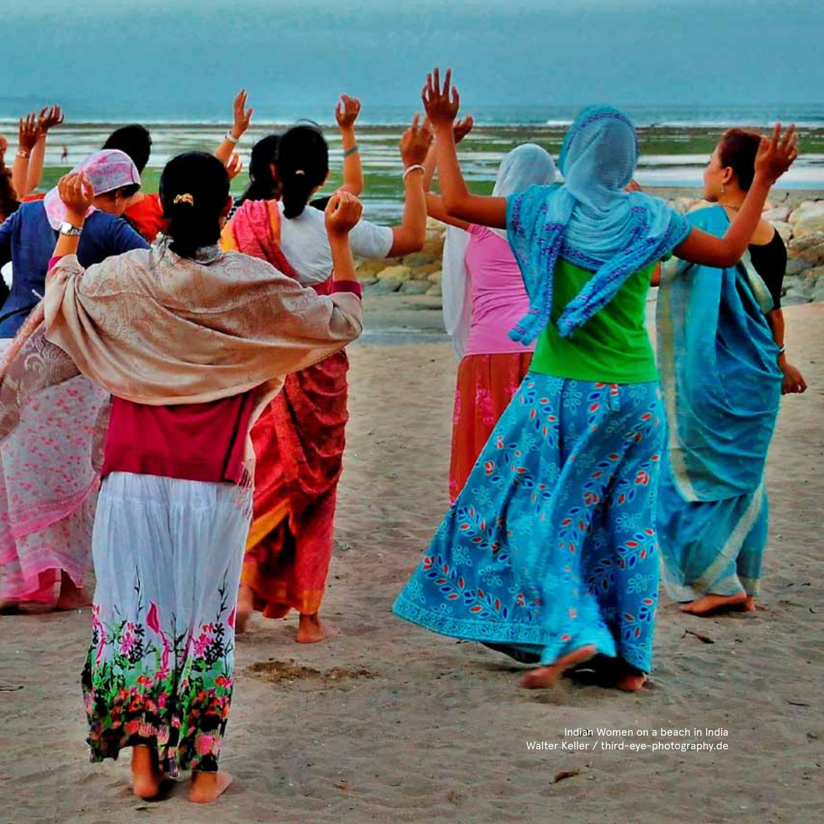
Indian Women on a beach in India