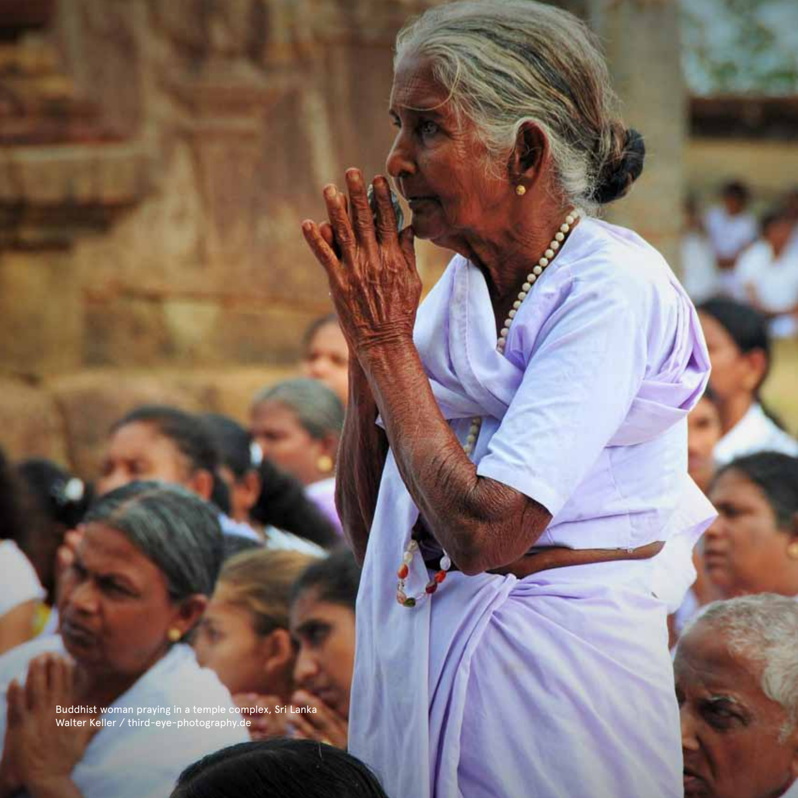
Buddhist woman praying in a temple complex, Sri Lanka