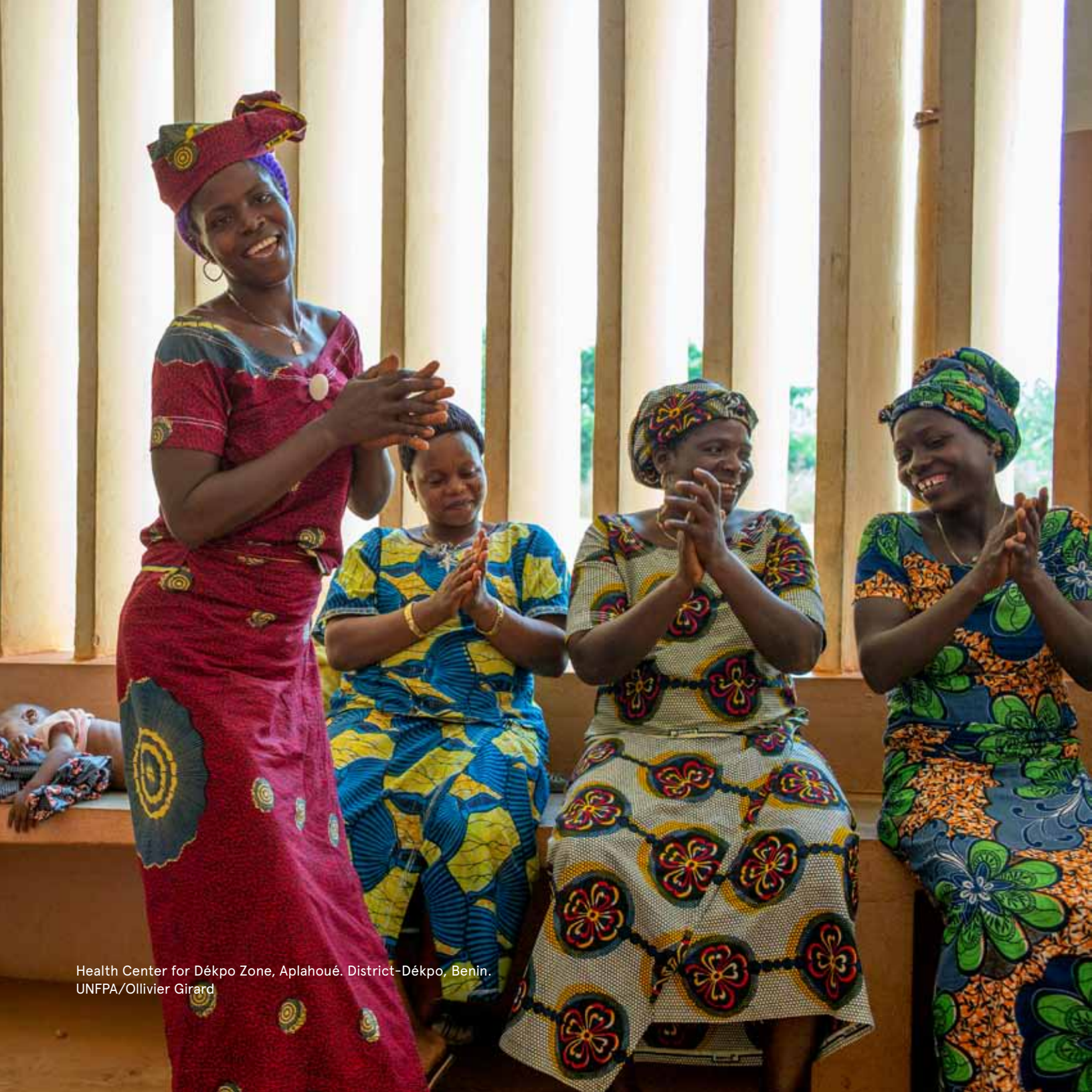
Health Center for Dékpo Zone, Aplahoué. District-Dékpo, Benin.