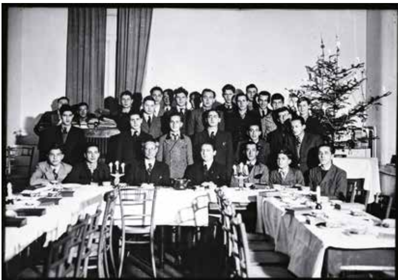
The young mens' association at Seegasse 16 celebrating Christmas.