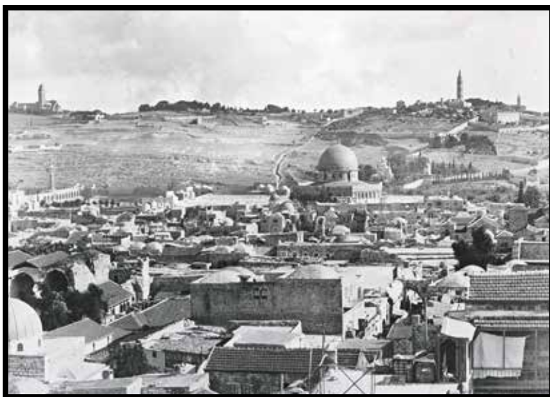
View from the Old City of Jerusalem to the Mount of Olives.