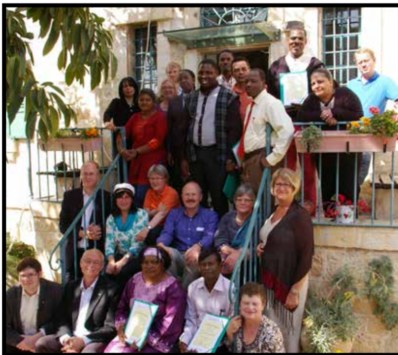
The International Course in 2011.

in Uppsala elaborated a new framework for STI activities in 1998, in which relations to and teaching about Judaism, Christianity and Islam were included.