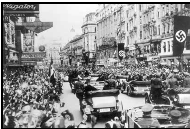
German troops parading in Vienna after the so-called Anschluss, in March 1938.

The work was now quite costly, and funds were provided through grants and collected money from the Swedish main office, but also from foreign organisations. Through contacts with Nazi authorities, and with Adolf Eichmann in particular, exit visas were obtained for some 3,000 persons, many of whom were children. Transports were