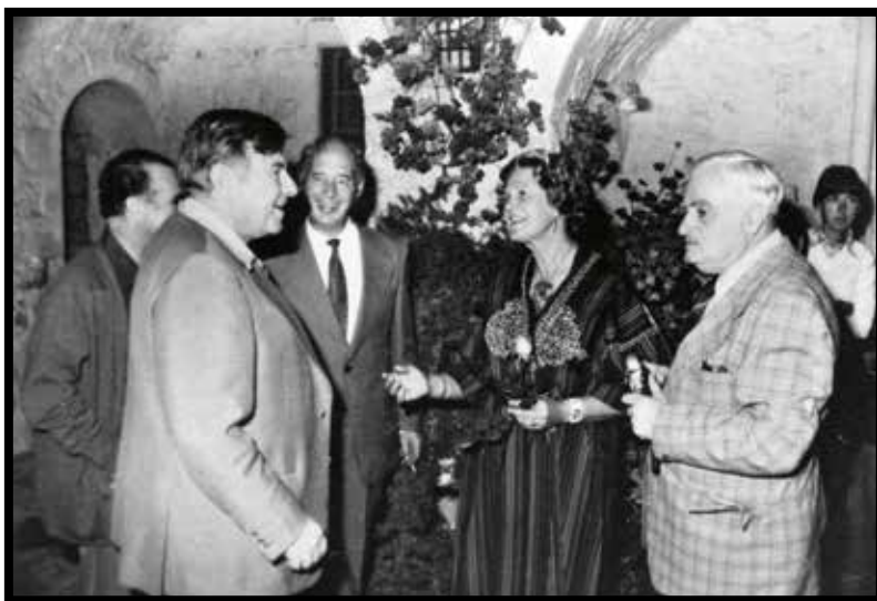
The mayor of Jerusalem Teddy Kollek visits the Swedish Theological Institute.