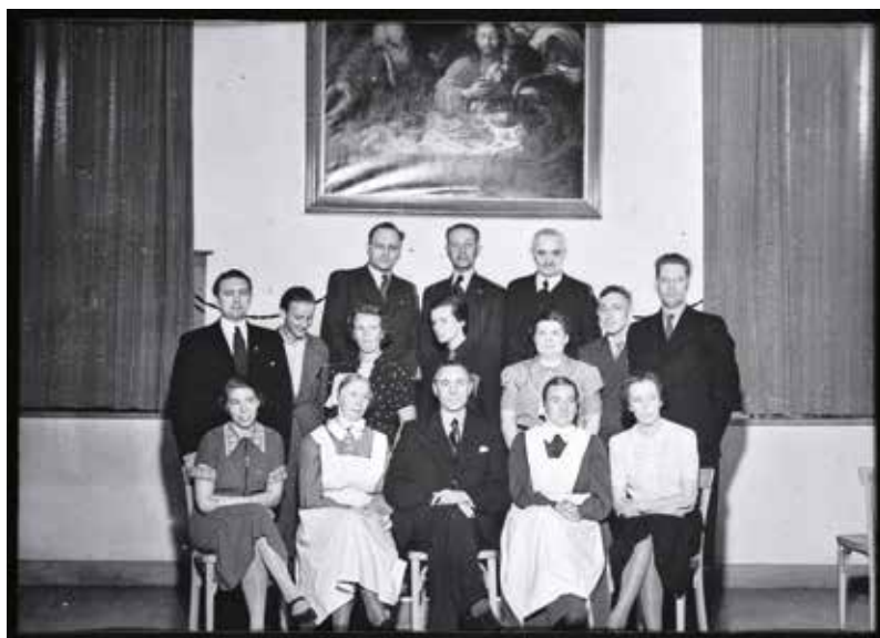
The staff at Seegasse 16 with Birger Pernow, the director of the Swedish Mission in the centre.

Another, more bureaucratic, issue was the name of the mission: Schwedische Gesellschaft für Israel (approximately the Swedish Israel Society). The Jewish dimension irritated the Gestapo. Following