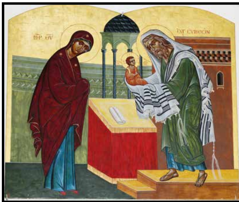
Jesus is presented in the Temple. The icon of Bengt Olof Kälde in the chapel of the institute.