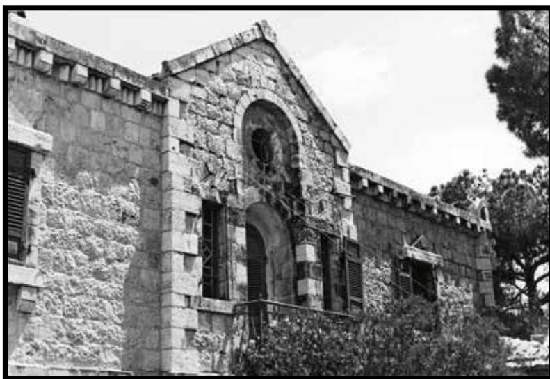
The building called Beit Tavor, "the house of Tabor", was the home of the famous Jerusalem architect Conrad Schick.

The house was well known in Jerusalem; it was built in 1882 by the famous architect and archaeologist Conrad Schick and was his home. Schick built some of Jerusalem’s new hospitals, schools and private houses during the last decades of the 19 th century. His home,