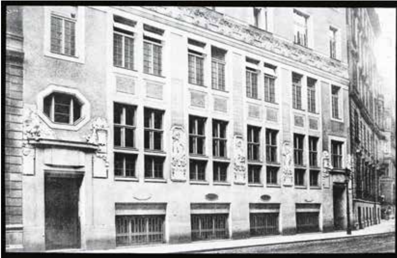
The building owned by the Swedish Mission to the Jews in the 1930s, Seegasse 16.

the 1920s. However, Sweden was a meagre place for mission work with few Jews in its population, whereas Vienna was more relevant in this respect. In Vienna, many Jews were married to Christians, and it was primarily this group that was targeted by the missionary work. The core of it all was the congregation of mostly Christians of Jewish descent who gathered to worship in a chapel called the Messiah Chapel at the address Seegasse 16 in Alsergrund.