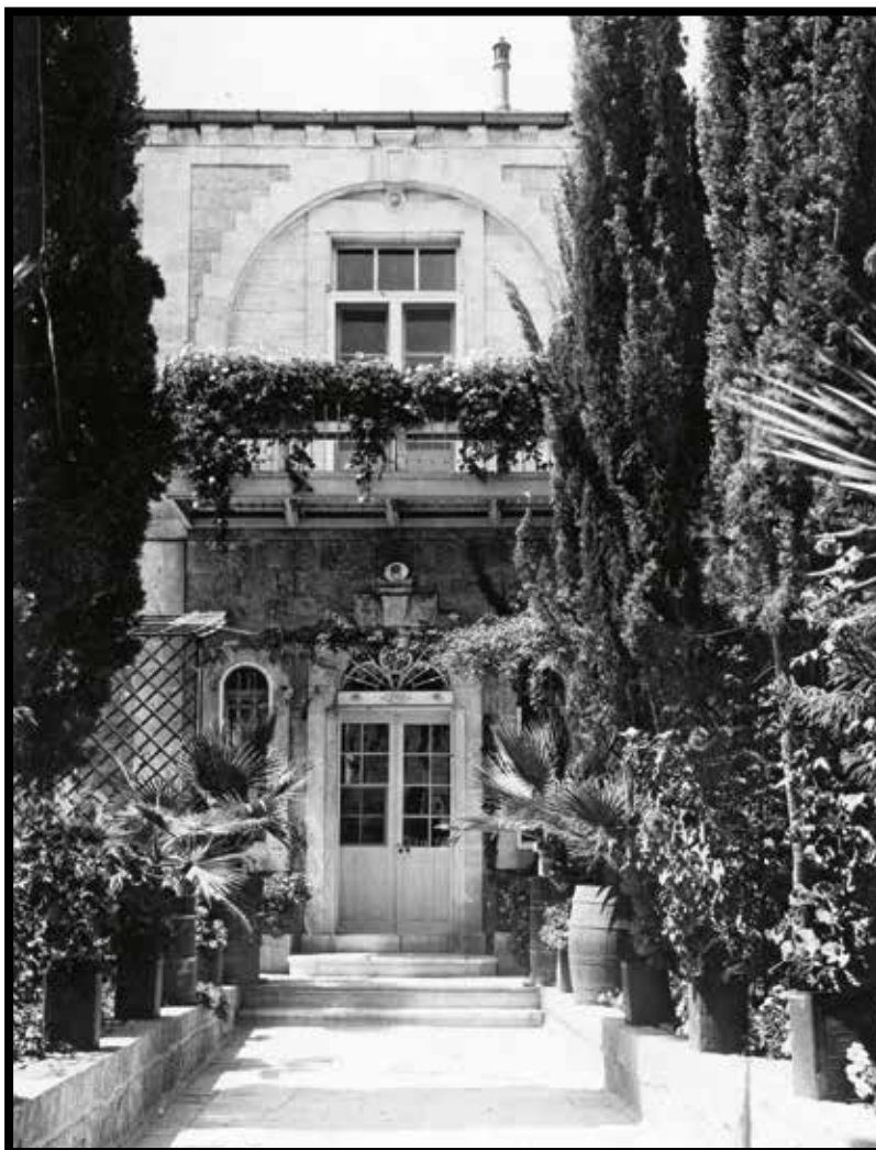
The Swedish Consulate at Nablus road in the beginning of 1947.