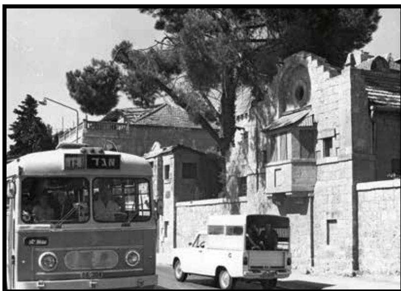
Rechov HaNevi'im, the Street of the Prophets', view outside the STI in the end of the 1960s.

The view on mission was not the only thing that was changed when the institute was established; the view on Zionism was changed as