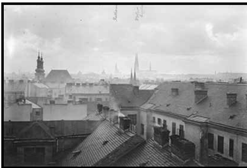
Vienna in the 1930s.